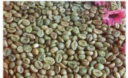
ROBUSTA SCR16 UNWASHED