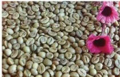
ROBUSTA SCR13 WP