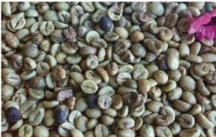
ARABICA SCR16 UNWASHED