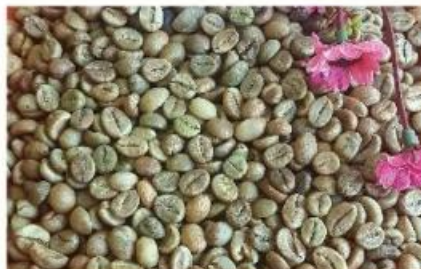
ROBUSTA SCR18 UNWASHED