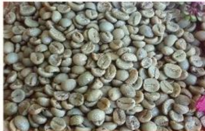
ARABICA SCR16 WP