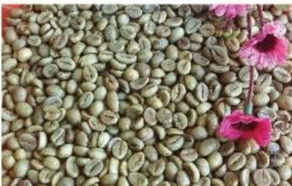
ROBUSTA SCR16 WP