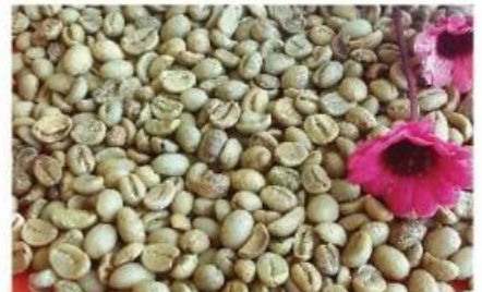
ARABICA SCR13 WP