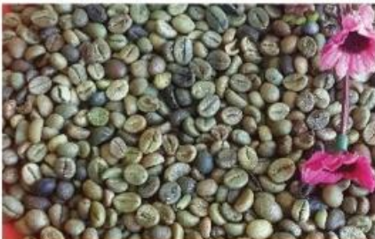
ROBUSTA SCR13 UNWASHED