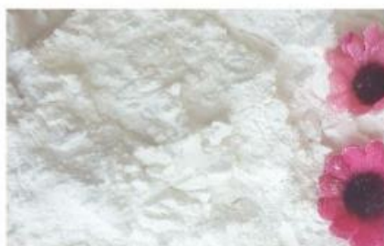
TAPIOCA STARCH FOOD GRADE