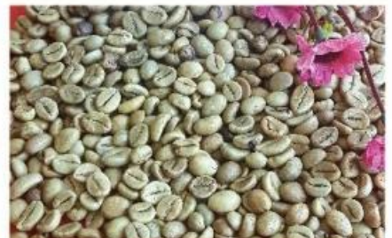
ROBUSTA SCR18 WP