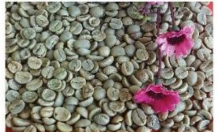
ARABICA SCR18 UNWASHED