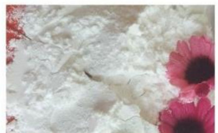
TAPIOCA STARCH INDUSTRIAL GRADE