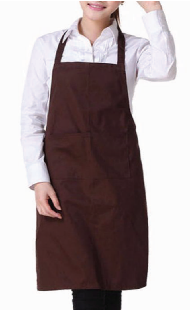
Uniforms of restaurants, hotels