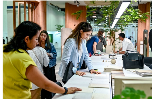
FIND 2024 visitor registration opened for the event on 26-28 September 2024 at Marina Bay Sands

Pre-registration has just opened for attendees, who will witness the future of Asian design and benefit from networking with industry leaders from across Asia. Visiting professionals can also attend captivating talks at the three-day FIND Global Summit , with opportunities for professional development (CPD points), engage in B2B matchmaking for qualified VIP buyers, and explore a vibrant marketplace , making it an essential event for the design community.