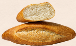
Wholegrain Rice Bread 4 pcs x 70g