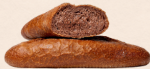
Wholegrain Red Dragon Rice Bread 4 pcs x 70g