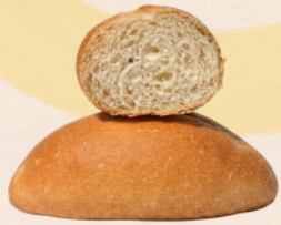
Wholegrain Rice Bread 10 pcs x 30g