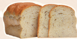
Wholegrain Rice Shokupan 1 pcs x 550g