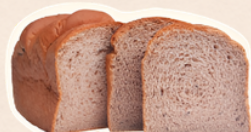
Wholegrain Red Dragon Rice Shokupan 1 pcs x 550g