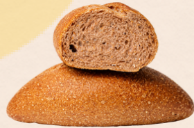
Wholegrain Red Dragon Rice Bread 10 pcs x 30g