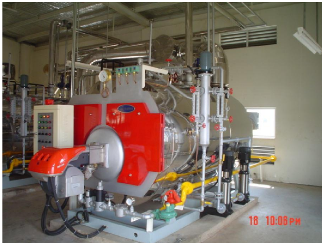
Picture of a boiler using diesel fuel.

It is noteworthy that the boiler is a source of extreme danger to human health. It can be explosive causing a terrible accident. And not just in old, dehumidified or domestic boilers, but even new ones imported from high-tech countries like Germany. . . The And not only explode in small scale factories, poorly industrialized behaviors, not strict discipline, but large scale factories, such as thermal power plants.