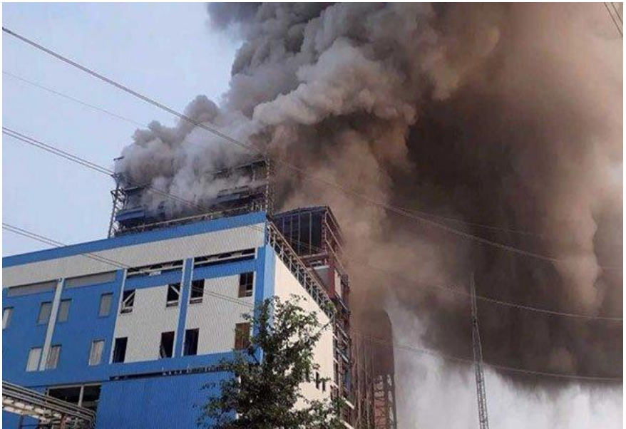
Smoke from the boiler explosion in India, 01-11-2017.

Uttar Pradesh, said the death toll could increase in the coming days due to the severity of some people being seriously wounded.